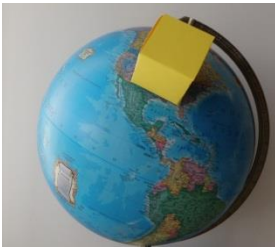
New Jerusalem Size Comparison

New Jerusalem — The New Jerusalem is a city in which the righteous from all ages will dwell for eternity. It is described in great detail in Revelation 21–22. The city is laid out in the shape of a cube. Its dimensions are given in Revelation 21:16 as 12,000 stadia (1,380 miles) per side. If this city were placed on the present earth, it would cover nearly \frac{2}{3} of the continental United States and the ceiling would extend into the exosphere of the planet. However, God may choose to create a much larger New Earth to accommodate this size. Since God can both create and alter the laws of physics; this large city (and possibly a larger New Earth) will not be subject to any adverse effects from the crushing weight of gravity. The city itself is constructed out of the finest materials — precious gems, pearls for gates, and streets paved with gold. Many people tend to associate these things with heaven, but this is not technically correct. These items belong to the New Jerusalem. The centerpiece of the city will be Christ Himself, whose radiance will provide light for the entire city (Rev 21:23).